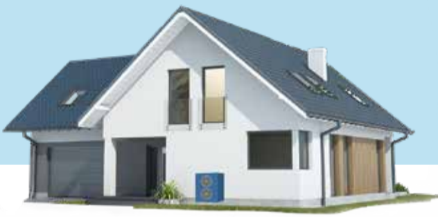
Residential Heat Pumps

Implementing the phase down of hydrofluorocarbon (HFC) refrigerants requires careful consideration when choosing a low-GWP alternative across different sectors and applications.